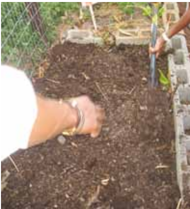
Isinyathelo 6: Faka umanyolo.