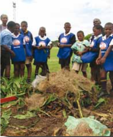
Isinyathelo 9: Utshani obusikiwe obomile

Qaphela: Udoti wasekhishini kufanele umbozwe ngokushesha ukuze kunciphe izilwanyana nephunga.