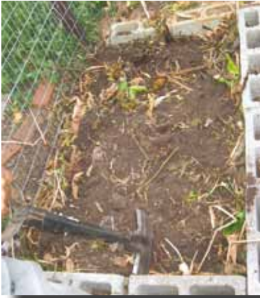
Isinyathelo 4: Faka inhlabathi.