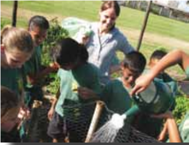
Isinyathelo 8 Amanzi.