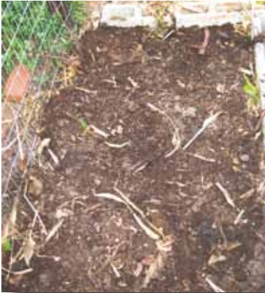
Isinyathelo 5: Faka umquba.